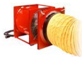
Adapter with Flexible Duct

Like all RESQTEC SuperVac series, ventilators are tested by AMCA